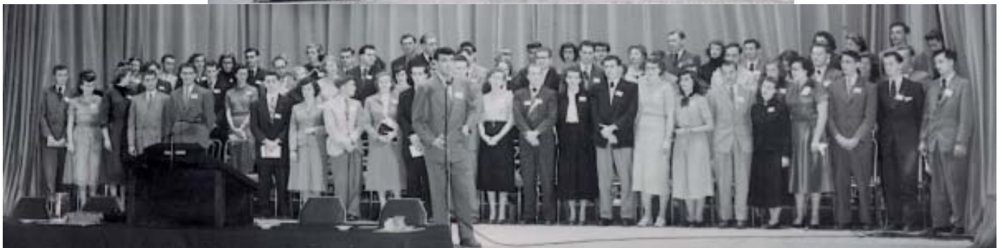
Celebrating 50 Years! The 1953 U.S. IFYE delegation included 116 participants representing 44 states. They were hosted by 38 countries. The call "Attencione!" became very familiar to the first summer group to depart (top) as it preceded every announcement aboard the Italian ship "Conte Biancamano," on which they traveled. They were on the high seas for eleven-sixteen days depending on their destination - Switzerland or Middle Eastern countries. All 1953 delegates returning in the late fall that year (above) were hosted in New York City by the Grocer Manufacturers of America before continuing on to Washington, D.C., for their consultation/evaluation program.