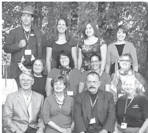
(Continued from Page 10 - "52nd European IFYE Conference")