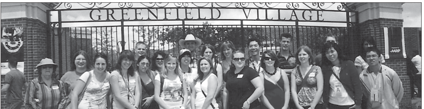
2008 U.S. IFYE Delegates and Inbound IFYE Exchangees - Orientation in Michigan

A challenge to all involved with 4-H: An Image of Excellence includes an International Dimension! ☆