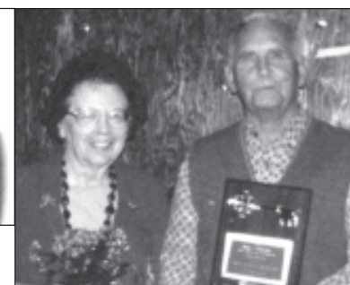
Citizens of the Year