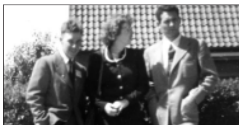
1953 Delegates to Austria