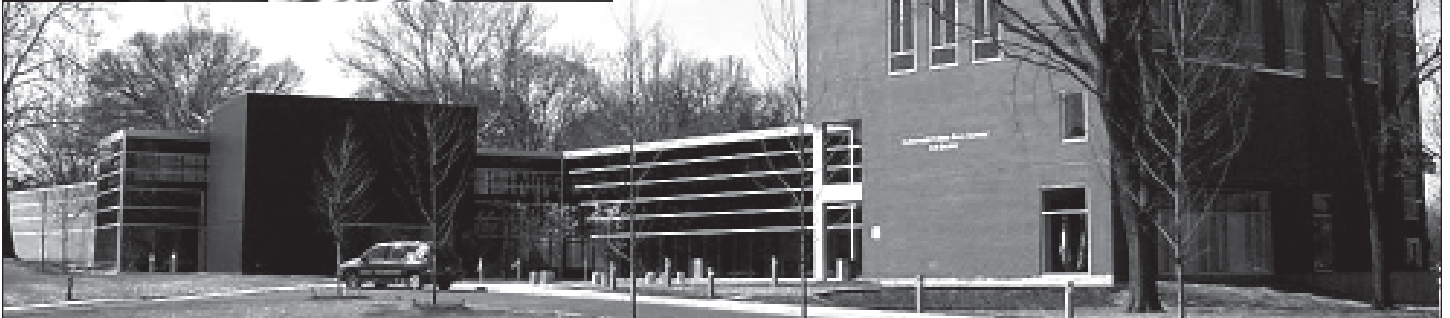
Nationwide and Ohio Farm Bureau 4-H Center at Ohio State University