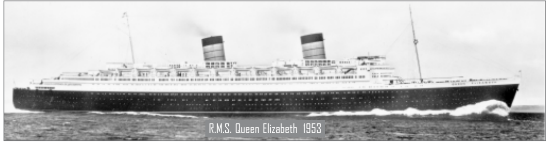
R.M.S. Queen Elizabeth 1953