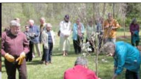
Memorial tree planting April 2005