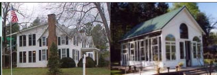
■ Hodge family home